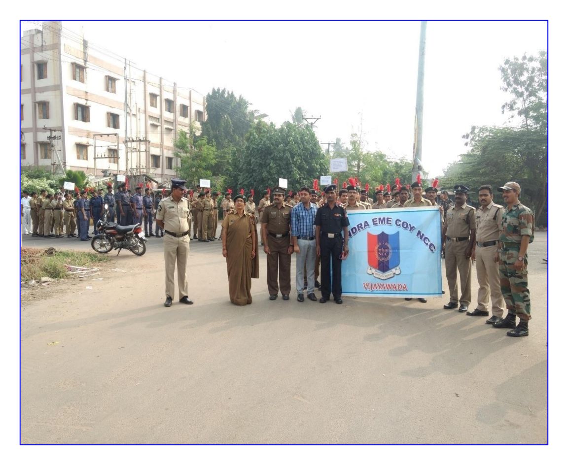
Awareness on Fundamental Rights

* It serves as a reminder that every person deserves dignity, equality, and justice, fostering awareness and action to address ongoing human rights challenges worldwide.